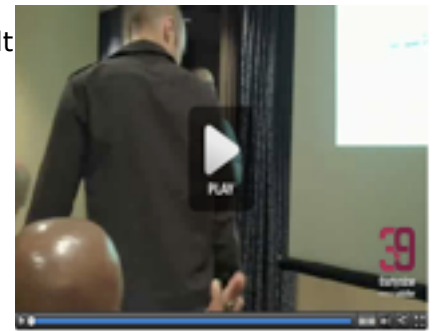
Get Apps Done , presented at Refresh Miami (video).