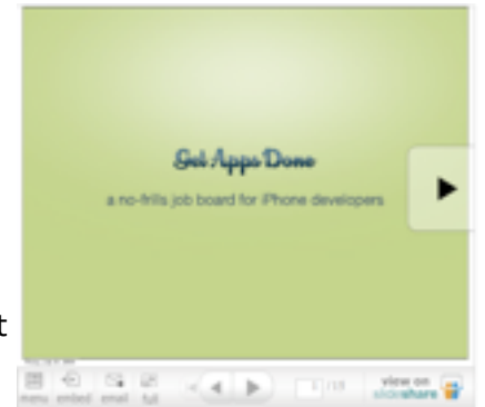
Get Apps Done , presented at Refresh Miami (slides).